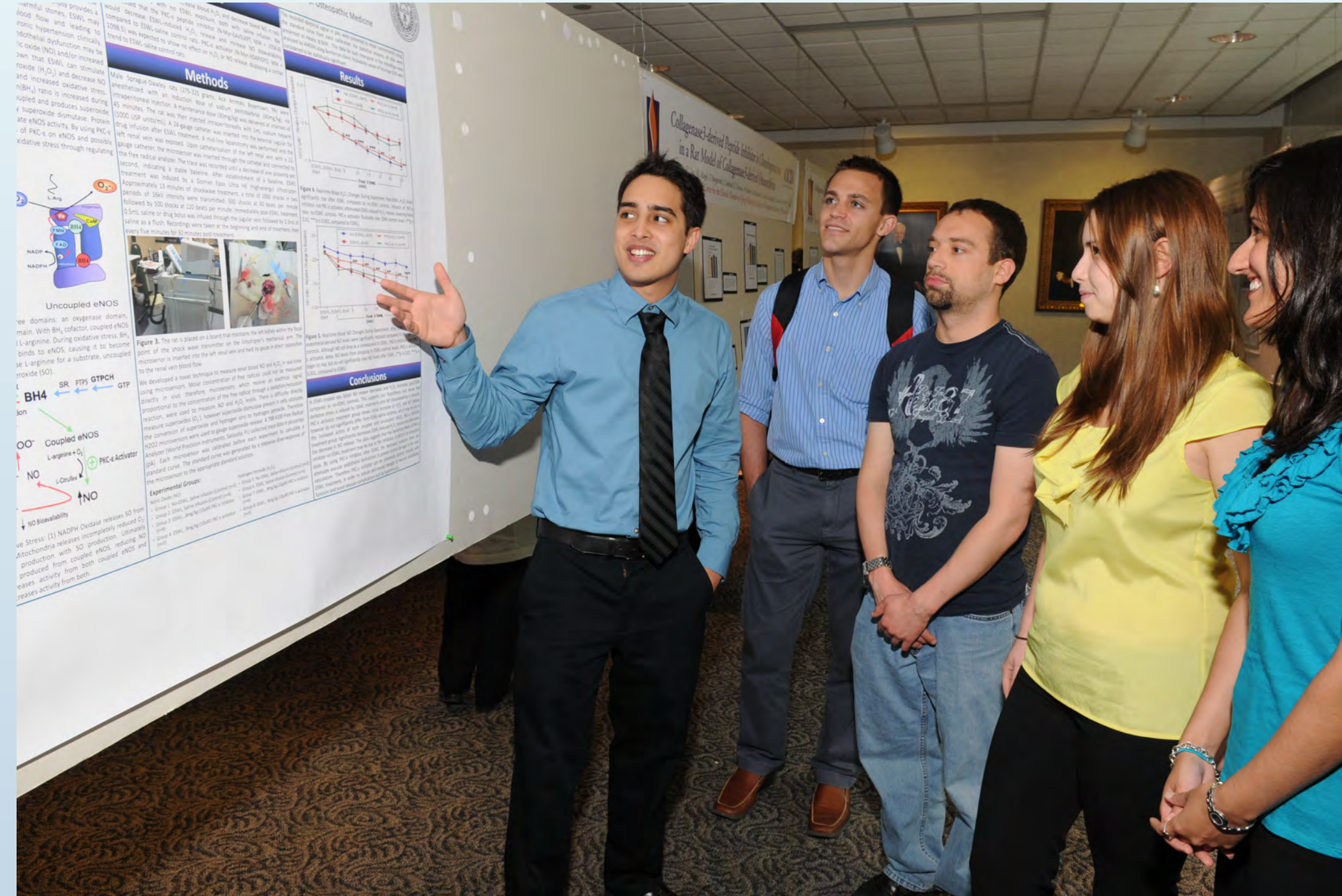
First Annual Research Day, 2011, PA Campus

Through the years, Research Day has been an opportunity for collaboration outside of PCOM. Many of our presenters work with researchers at other institutions, from students on rotation to faculty continuing long-term research collaborations. Students from Olney Charter High School and Esperanza College, which has partnered with PCOM in its Science Math and Summer Academy, have also presented posters at Research Day. PCOM's keynote speakers have come from a variety of institutions, from local institutions like Drexel University and Georgia Institute of Technology to national centers like the National