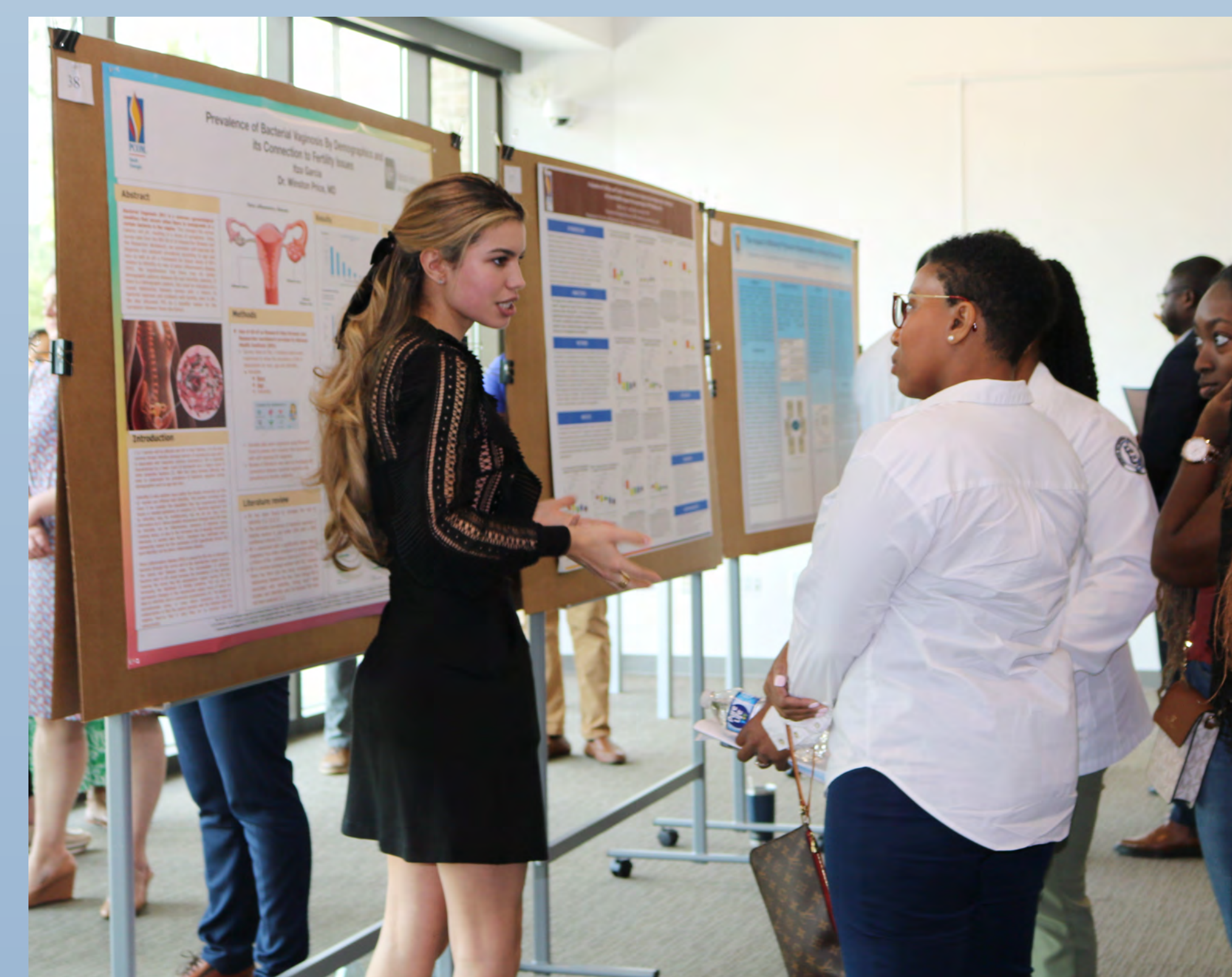
Twelfth Annual Research Day, 2023, SGA Campus

When the COVID-19 pandemic closed all of PCOM's campuses in 2020, PCOM's 10th annual Research Day was postponed. By the next year, PCOM was able to apply its new expertise with online instruction to hold an entirely virtual Research Week 2021. Presenters uploaded short videos to accompany their posters, capitalizing on the virtual conference platform to let all attendees see presenters from any campus. South Georgia campus, whose first students matriculated in 2019, participated for the first time.